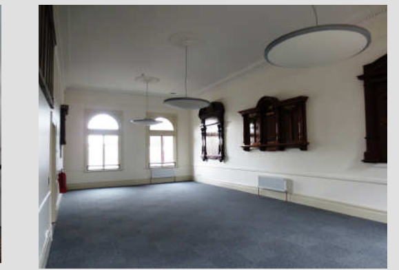
Internal Restoration work completed - meeting rooms, hallways, staircase